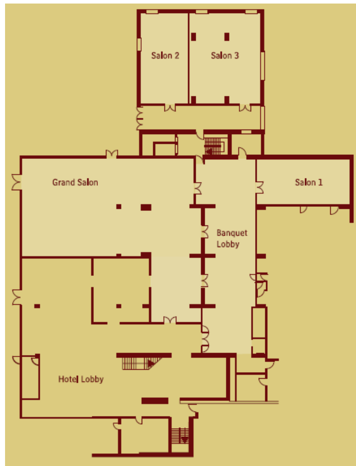
Fig.: Hotel International

Hotel has free of charge wireless internet access.