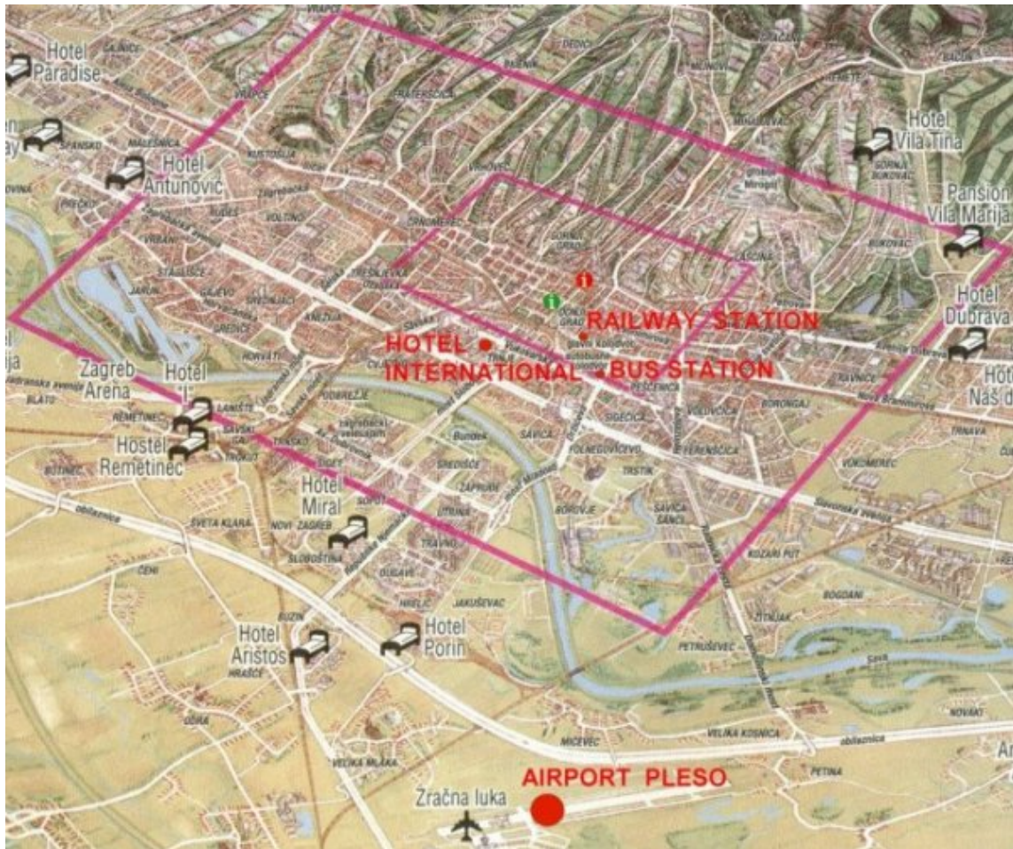
Fig.: Zagreb overview