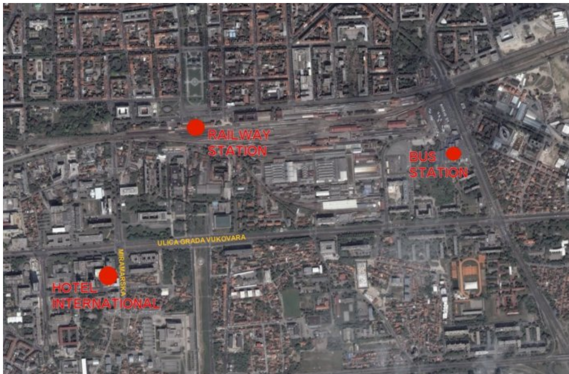
Fig.: Zagreb overview

If you are coming to Zagreb from south drive along Avenija Dubrovnik until the intersection with Avenija Većeslava Holjevca. At the intersection turn in the direction north, drive over the bridge until you reach the intersection with Vukovarska street. At the intersection turn left and after 100m turns left again into Miramarska street. The hotel is to your right.