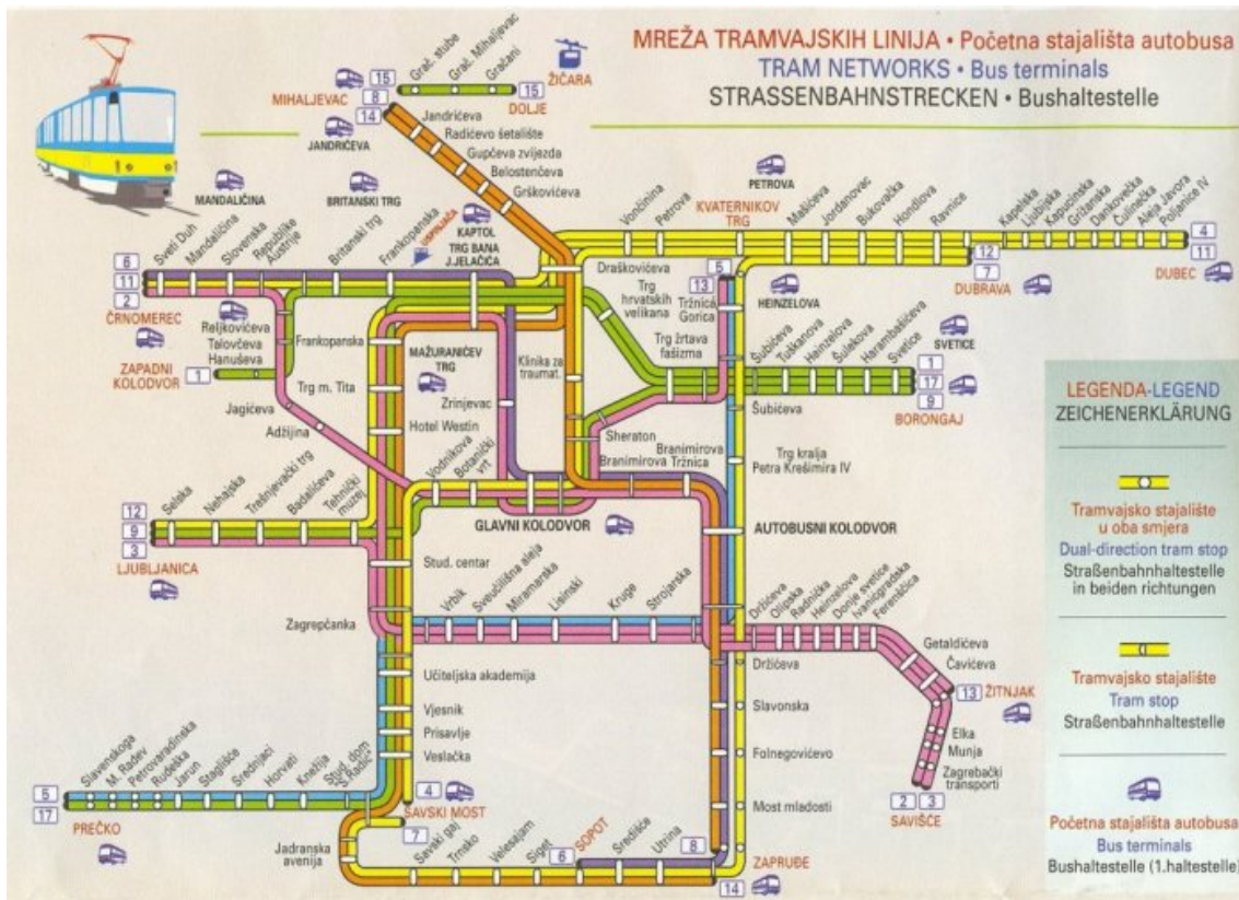
Fig.: Zagreb TRAM Networks