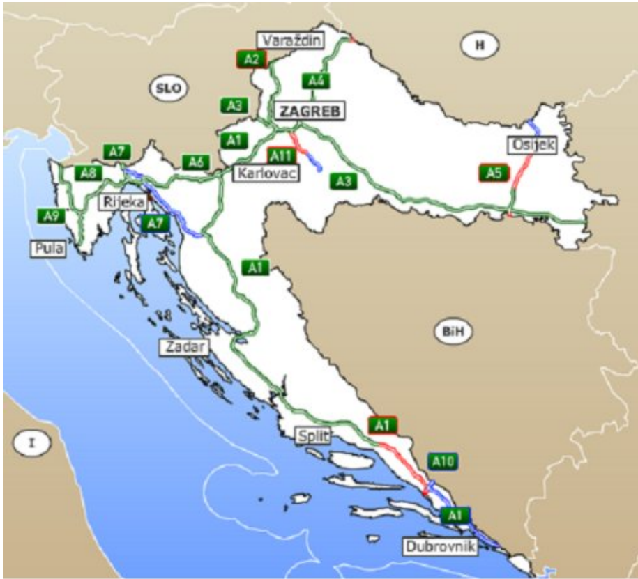
Fig.: The main Croatian roads

Present Road conditions could be found on the Internet site http://www.hac.hr/